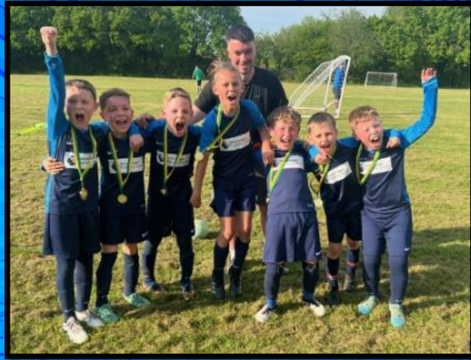
A huge well done to the Year 4 boys who played in the Colton Sports and Social Club football tournament and came 1 st !